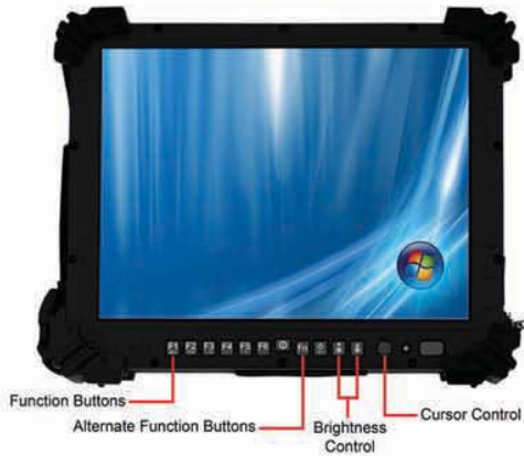
12.1" XGA Anti-Reflective TFT LCD